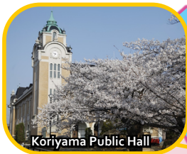
Koriyama Public Hall