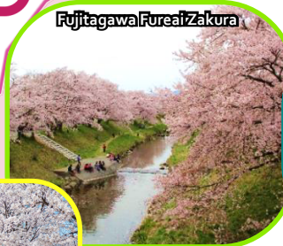
Fujitagawa Fureai Zakura