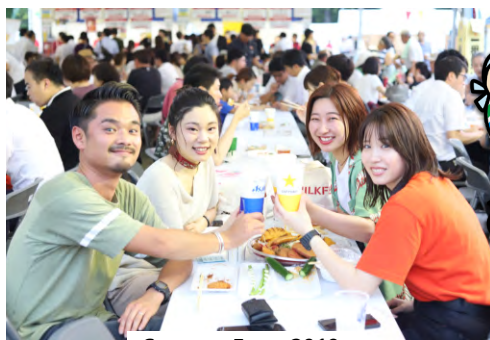
Summer Festa 2019

Summer Festivals - It's turning out to be a hot summer, but packed with fun activities and festivals. From the Summer Festa to the Uneme Matsuri, the city turned out in droves to join in. Check out some of the photos from the summer fun!