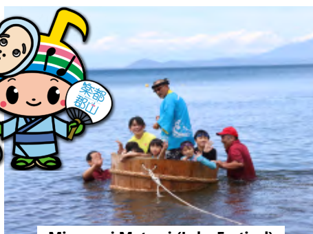
Mizu-umi Matsuri (Lake Festival)