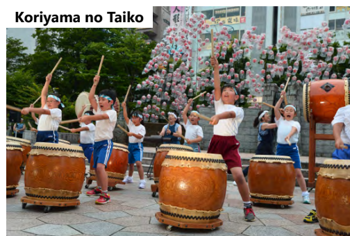
Koriyama no Taiko